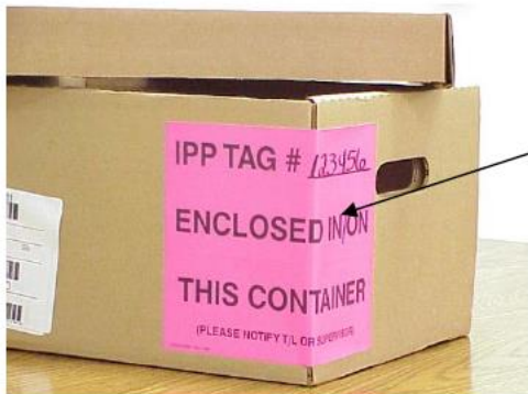
Labels wrapped around corner